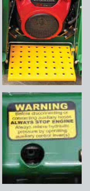
Safety Relief Valve -The lift circuit is set at 2400psi to protect the operator from overloading the machine.

Larger Operators Platform allows for wider stance for improved safety and fatigue reduction.